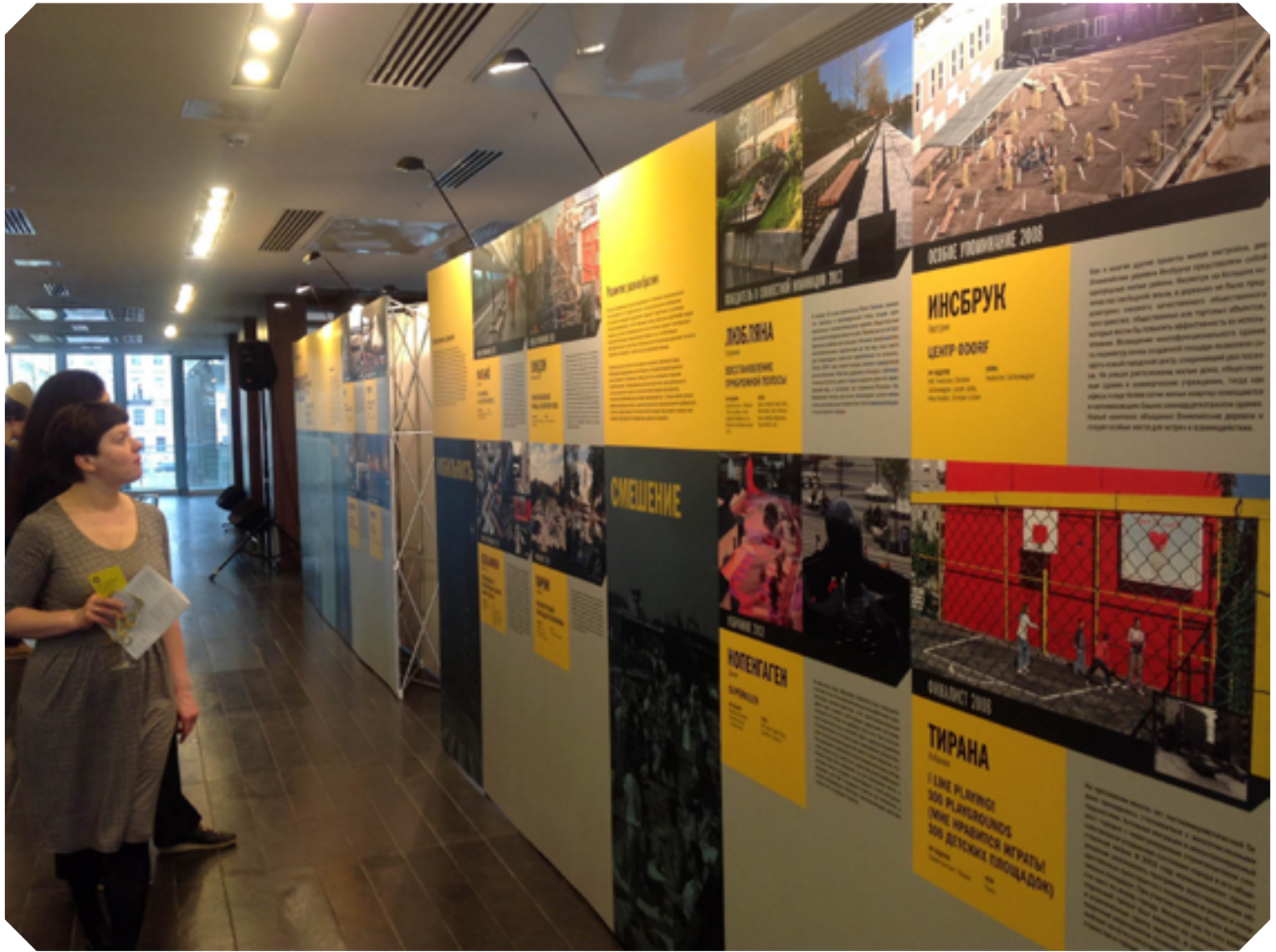
st. petersburg 2016

In 2023, under the comission of the Spanish Embassy in the US and coinciding with the Spanish presidency of the European Union, the CCCB presents a revised version of “Polis” which, on this special occasion, focuses on the best works of intervention in public space in Spain during the last twenty years. The exhibition is, then, a journey through 25 projects showing the improvement of public spaces in Spanish cities, reflecting on globally shared challenges, and presenting solutions that contribute to more democratic cities. The exhibition is to be opened at Dupont Underground, Washington, on October 2023, after which it can be shown in other American cities.